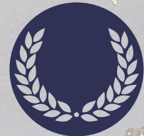
CAESAR London to Rome