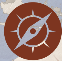
STRZELECKI Sydney to Hobart