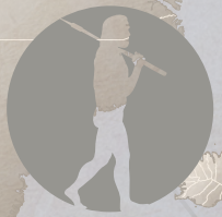
CRO-MAGNON Chauvet to Perpignan