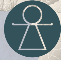
3 ISLANDS Corsica, Sardinia and Sicily