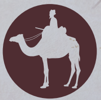
CONQUEST OF THE MOORS Fez to Cordoba