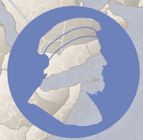
MARCO POLO Venice to Athens