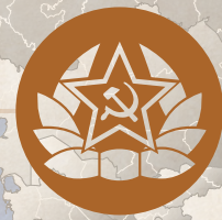
IRON CURTAIN Berlin to Budapest