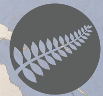
MAORI Auckland to Queenstown