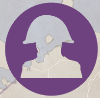
NAPOLEON Paris to Saint Petersburg