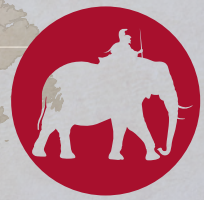
HANNIBAL Barcelona to Gavi