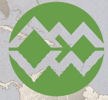
APPALACHIAN Maine to North Carolina