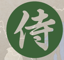
SAMURAI Honshu and Shikoku Islands