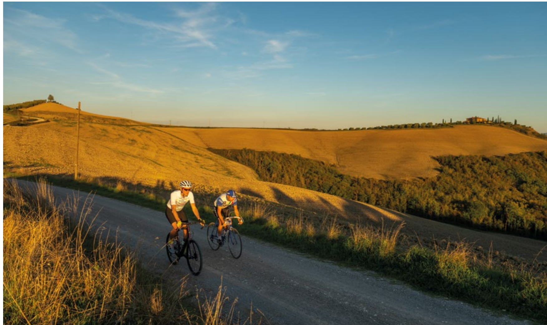
Top left: A pit stop in Buonconvento, where all roads lead to...