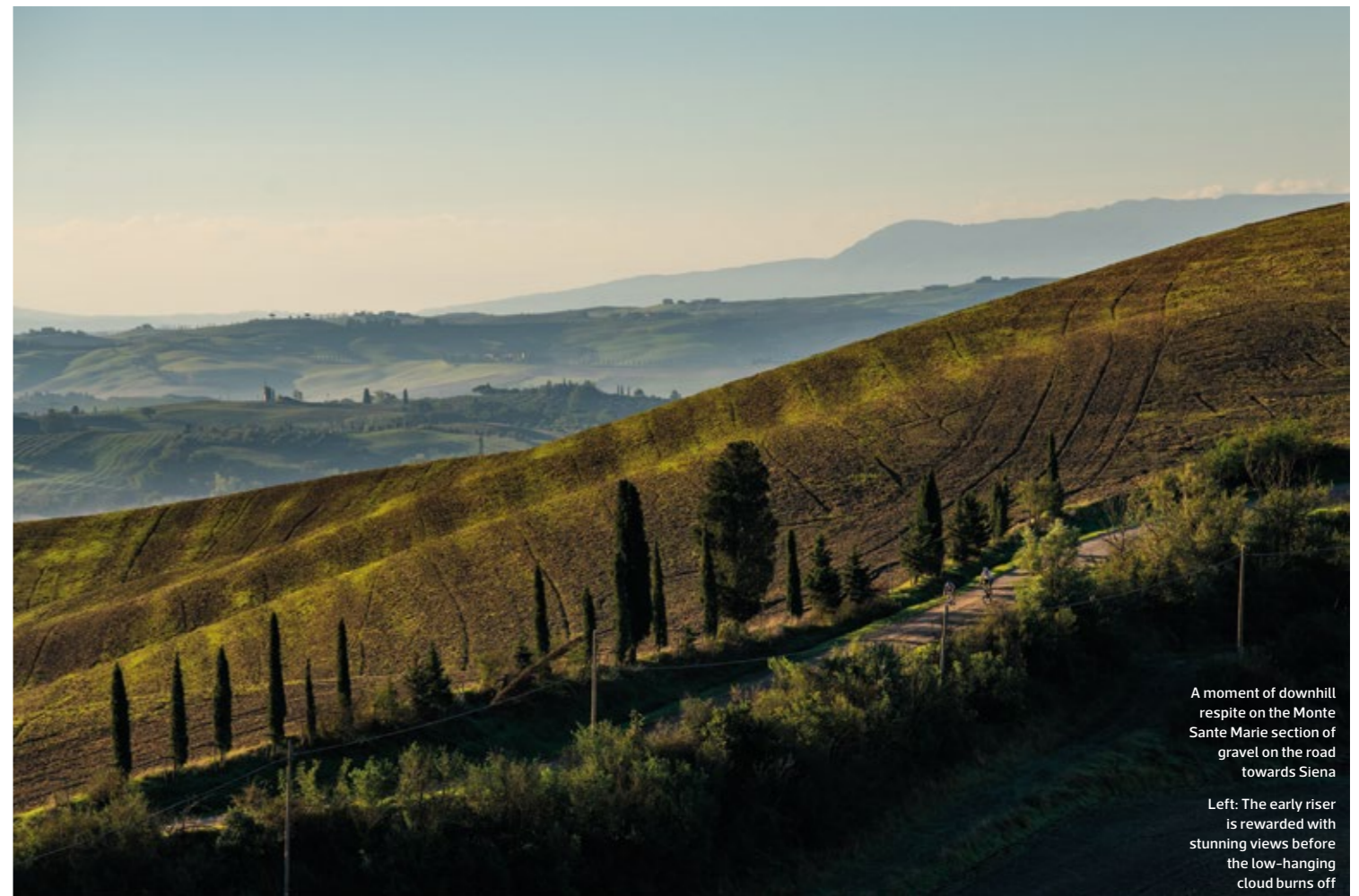
A moment of downhill respite on the Monte Sante Marie section of gravel on the road towards Siena